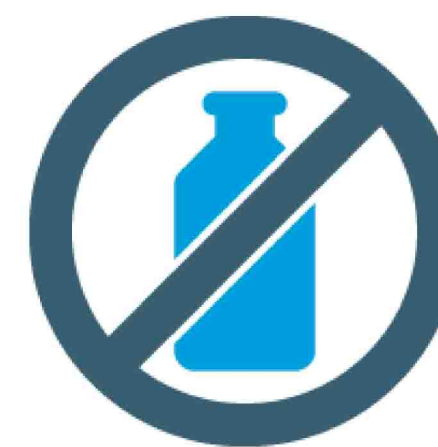
Tested for Dairy