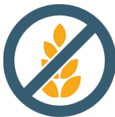
Tested for Gluten