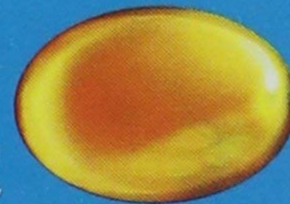
Actual capsule size

*DHA contributes to maintenance of normal brain function. The beneficial effect is obtained with a daily intake of 250mg of DHA.